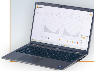
Sigycop report example